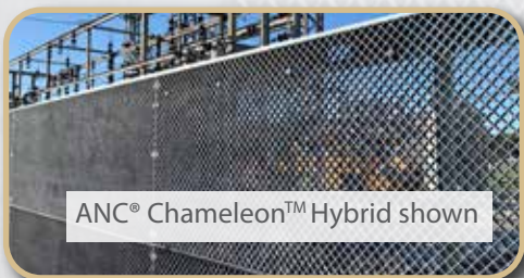
ANC® Chameleon™ Hybrid shown